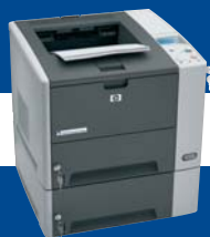
TROY MICR 3005 Secure Ex Printer