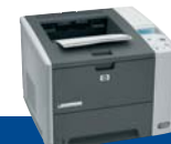
TROY MICR 3005 Printer