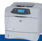
TROY MICR 4250 Printer