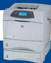
TROY MICR 4250 Secure Ex Printer