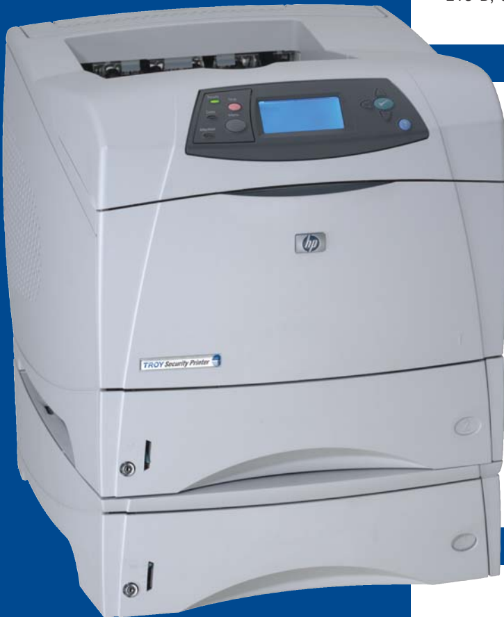
TROY MICR Secure printer shown with optional 2nd 500-sheet tray and tray locks.