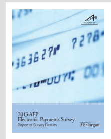
2013 AFP Electronic Payments Survey www.afponline.org/epayments

The 2013 AFP Electronic Payments Survey revealed that 50 percent of a U.S.-based organization's business-to-business (B2B) payments were made by check. However, the share of B2B check payments has declined considerably from the 81 percent reported in the 2004 survey. There was also a sharp decline in the share of organizations that relied on checks for over 60 percent of their payments—from 75 percent in 2004 to 41 percent in 2013.