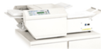
Table Top Pressure Sealers

* Requires 2-sided printing ** Incorporates a return envelope